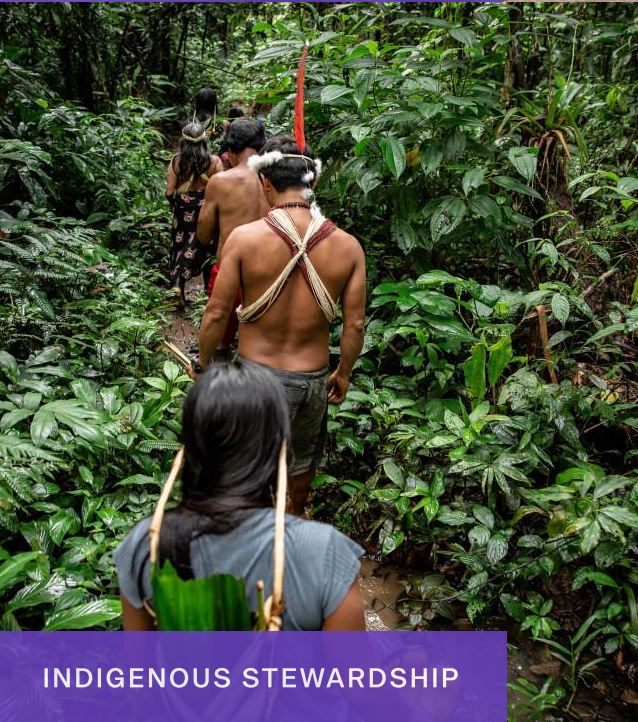
DRIVING SYSTEMIC CHANGE

introduced in England, with Blue Marine Foundation playing a key role through its policy work, laying the foundation for improved protection of vital marine ecosystems.