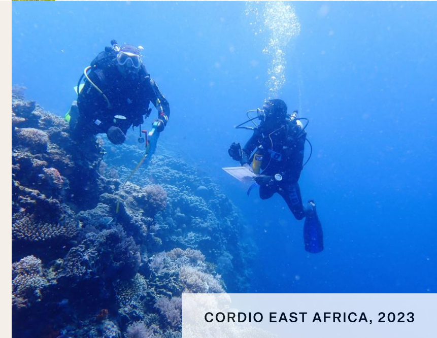
CORDIO EAST AFRICA, 2023

Advocacy, through actions like litigation, public campaigns, and shaping policy reforms, is essential for environmental and social justice. It involves pushing for changes in laws and corporate practices to protect forests and support community rights.