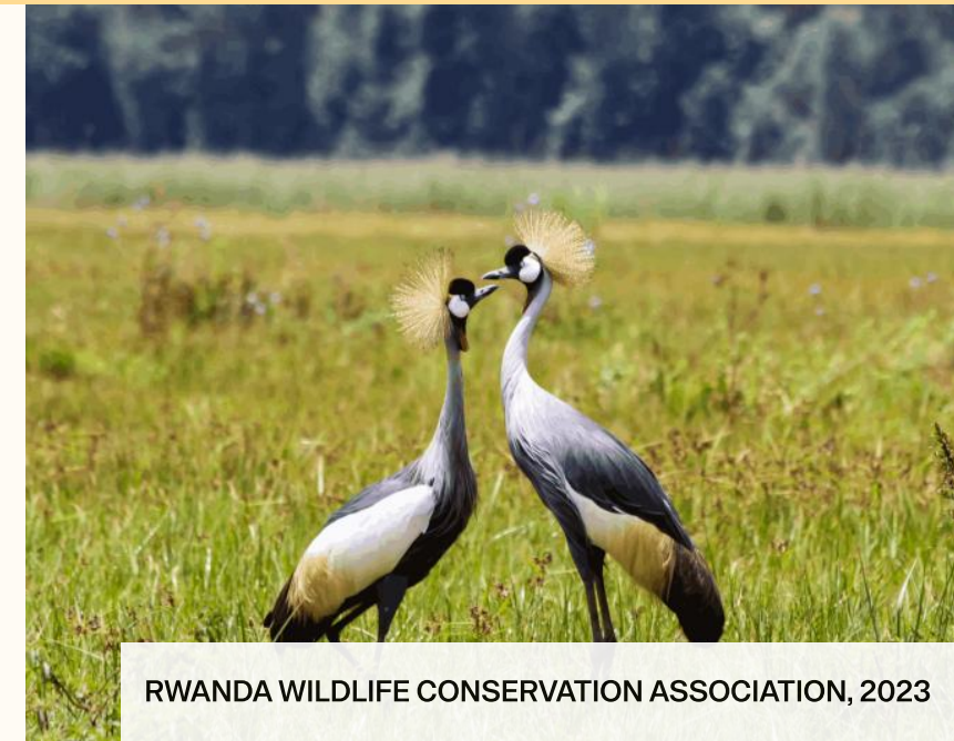
RWANDA WILDLIFE CONSERVATION ASSOCIATION, 2023

Empowering local communities to spearhead conservation and restoration efforts and shape strategies for sustainable resource management ensures initiatives deliver both environmental outcomes and tangible community benefits.