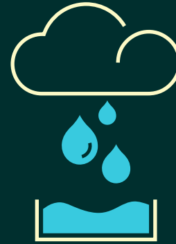
Collecting and cleaning rain water

This document is provided for information purposes only and intended exclusively for residents in Switzerland. It is not directed at and is not intended for use by or distribution to "U.S. Persons". radicant bank ag does not guarantee, represent and warrant or shall be liable for (i) the accuracy, completeness, availability, reliability or timeliness of any information provided; (ii) financial instruments being approved for sale and distribution or offer; (iii) the future performance of financial instruments; or (iv) any investment decision made or action taken in reliance upon any information contained herein. You should not make any investment decision solely based on the information provided. You remain responsible for obtaining sufficient information about specific investment products and financial instruments.