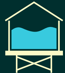
Water treatment plants to help provide clean water to homes