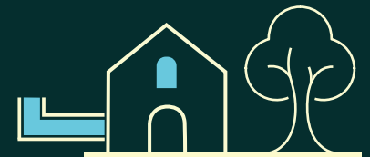
Clean logistics or "green" real estate