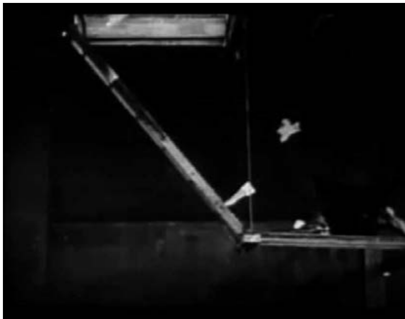
2. Film still from A WOMAN IN GREY (Serico, 1920). Underneath the trap door, a halfway-extended, intermediate story becomes visible, with a ladder that connects to the trap door (episode 9, 'Burning Strands').

Such sequences indicate an understanding of films as enabling only a partial view. The frame captures a portion of the contingent, assembling what can be considered anecdotal evidence of an inferable larger space. By visualizing some of the elements that were previously neglected, the following episode acknowledges film's need to exclude elements from screen. The acknowledged partial indexing of the contingent—that is, the understanding that film compiles anecdotes—is what most readily differentiates the vernacular modernism of film serials from other filmic forms. 4 In short, film serials employed an anecdotal approach to filmic