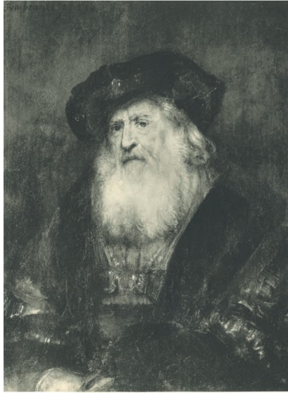
..272. PORTRAIT OF A RABBI. 1654. Dresden, Museum. (Panel 102 128)

3 Rembrandt workshop, Bearded Man with Black Beret , 1654 Oil on panel, 102 × 78 cm