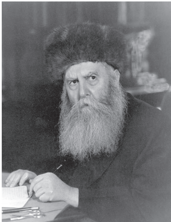
4 Photograph of Rabbi Yosef Yitzchak Schneerson, 1940s Reproduced in mirror image.

Rosenberg was not unique in seeing Rembrandt's many depictions of subjects from the Old Testament as evidence of sympathy for Jews and Judaism. These works surely affected the way Rembrandt was seen through Jewish eyes. The only two documented purchases by a contemporary Jew of finished work by Rembrandt—an etching plate bought in 1637 by Samuel d'Orta and a painting bought in 1639 by Alfonso Lopez—were both of Old Testament subjects (see figs. 13 and 135). They were moreover subjects pertaining to tension between Jews and others, tension of a kind being experienced by the Jewish buyers. The etching plate depicted Abraham driving off his concubine Hagar and their son Ishmael. Ishmael was to become the progenitor of the Arab tribes who founded Islam. The fortunes of the Sephardi Jews of Spain, Samuel d'Orta's people, were intertwined with those of the Iberian Muslims. The painting bought by a Jew, Alfonso Lopez, showed the non-Jewish prophet Bileam who, having been called upon to curse the Jewish people, is on his way to bless them. In his dramatic life, Lopez, too, navigated a fraught dividing line between religions.