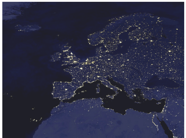
Europe by night