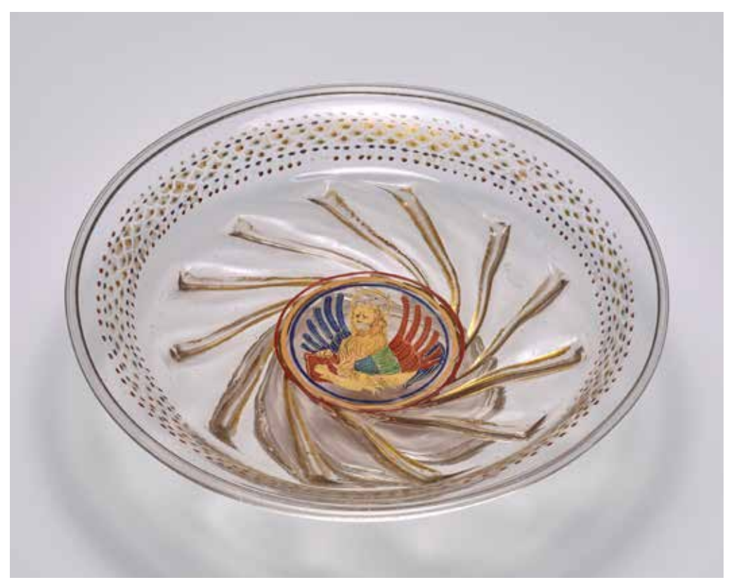
Figure 0.2: Glass bowl, Murano, around 1500. D: 25.50 cm, H: 7.0 cm. London, British Museum, museum number: S.375.

Renaissance societies developed innovative artistry and ingenious inventions when dealing with materialities. This glass bowl from a Murano workshop almost transcends its own materiality by creating effects of translucency and spotless transparency. Additionally, the representation of the Republic's patron saint in the centre of the bowl underlines the artefact's close connection with Venice. Produced in the Lagoon for both the domestic market and for export, however, its distinct malleability and manifest quality to imitate other materials made glass a common Renaissance materiality that was particularly apt to respond to formal and stylistic desires of the time.