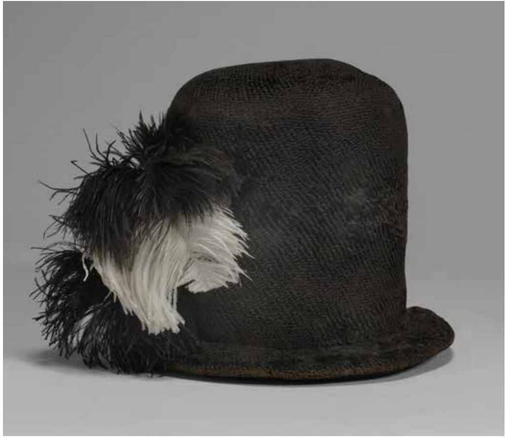
Figure 0.4: High felt hat with silk pile and ostrich feathers, of the kind sourced by Hans Fugger during the second half of the sixteenth century. H: 22.5 cm. Nuremberg, German National Museum.

These hats were relatively cheaply produced through new techniques that imitated velvet and were similarly soft. The ostrich feathers on this hat were added later but cohere with images from the period. They would have contributed to the new haptic and affective experience of a supremely soft piece of headwear for men.