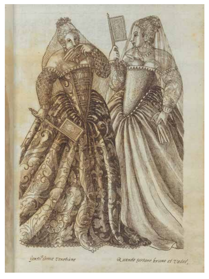
Figure 0.3: Jean Jacques Boissard, Gentil' donne venetiane/ Quando portano bruno et Vedoé, costume book [Trachtenbuch] for Johann Jakob Fugger, 1559, fol. 63. Pen and ink drawing. Herzogin Anna Amalia Library, Cod. Oct. 193.

The two Venetian noblewomen, "when dressed in dark colours and widowed," model precious, gossamer mourning veils. Made from striped or crimped, translucent textiles, they represent the highest artisanal standard that was produced at the time in centres like Bologna. Alongside the veils' visually stimulating, delicate materiality, the women's fashionable, perfumed gloves address the sense of smell. The scents they carried offered protection to the highly permeable and vulnerable early modern body. As well as mental, moral, and physical dangers, they also indicated the luxury afforded by the wealthy.