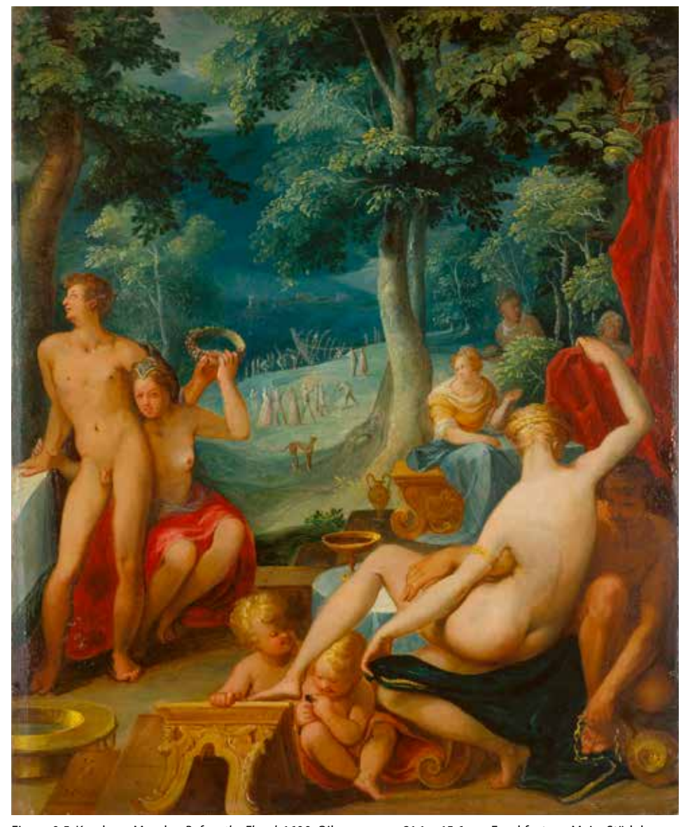
Figure 0.5: Karel van Mander, Before the Flood , 1600. Oil on copper, 31.1 \times 15.6 cm. Frankfurt am Main, Städel Museum, inv. no. 2088.

Created in the auspicious year of 1600, Van Mander's depiction of nude figures in a landscape setting is a self-assertive statement about his role as a painter-poet and a promoter of Netherlandish art. The reflecting surfaces of the golden vessels and the golden hues on the foliage display his mastery in "reflexy const," considered as the greatest achievement of Netherlandish art. The metallic support enhances the jewel-like appearance of this small painting in oil that catered to a growing taste among art collectors for effects of light and shade.