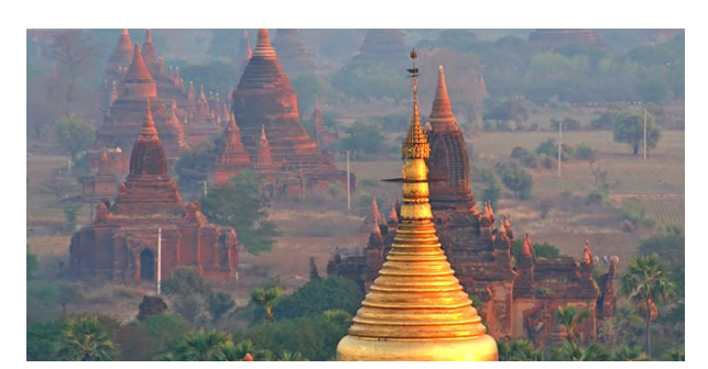
Bagan, Myanmar.