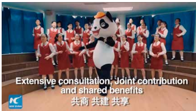
Figure 1.1 Extolling the virtues of the Belt and Road; screenshot of YouTube music video taken on 25 June 2020