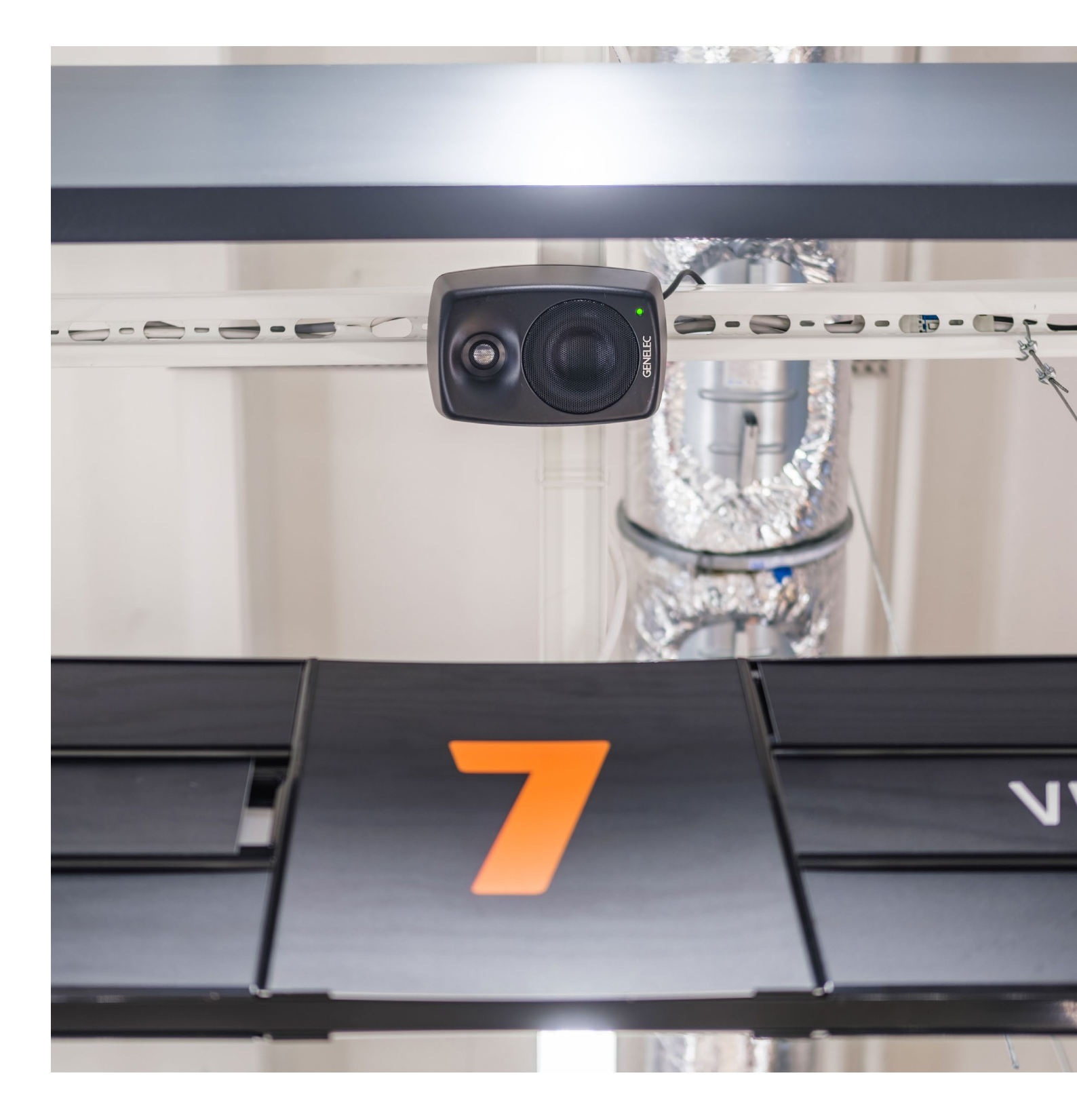
K-SUPERMARKET USES SENSORY MARKETING TO CREATE AN ATTRACTIVE ENVIRONMENT FOR CUSTOMERS