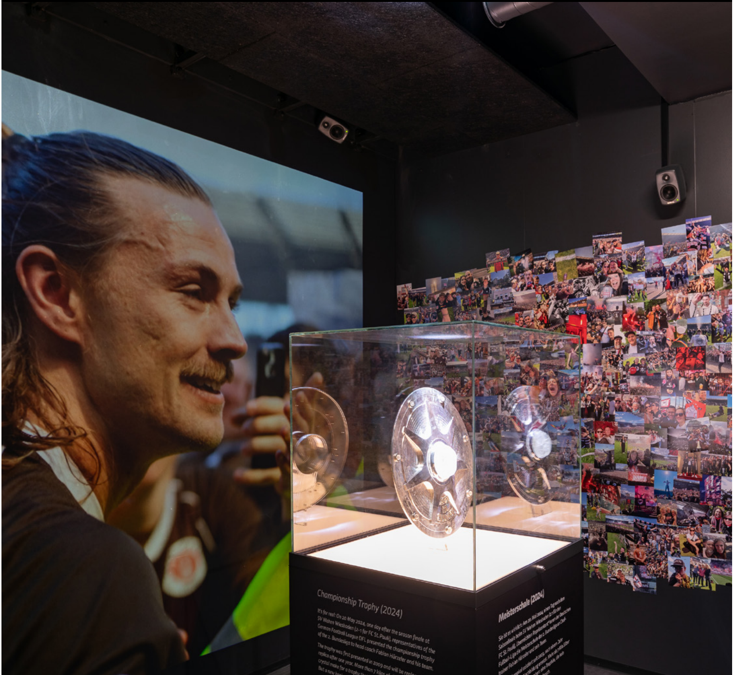
Championship Trophy (2024)

IMMERSIVE SOUND CELEBRATES THE HEART AND SOUL OF COLOURFUL HAMBURG FOOTBALL CLUB