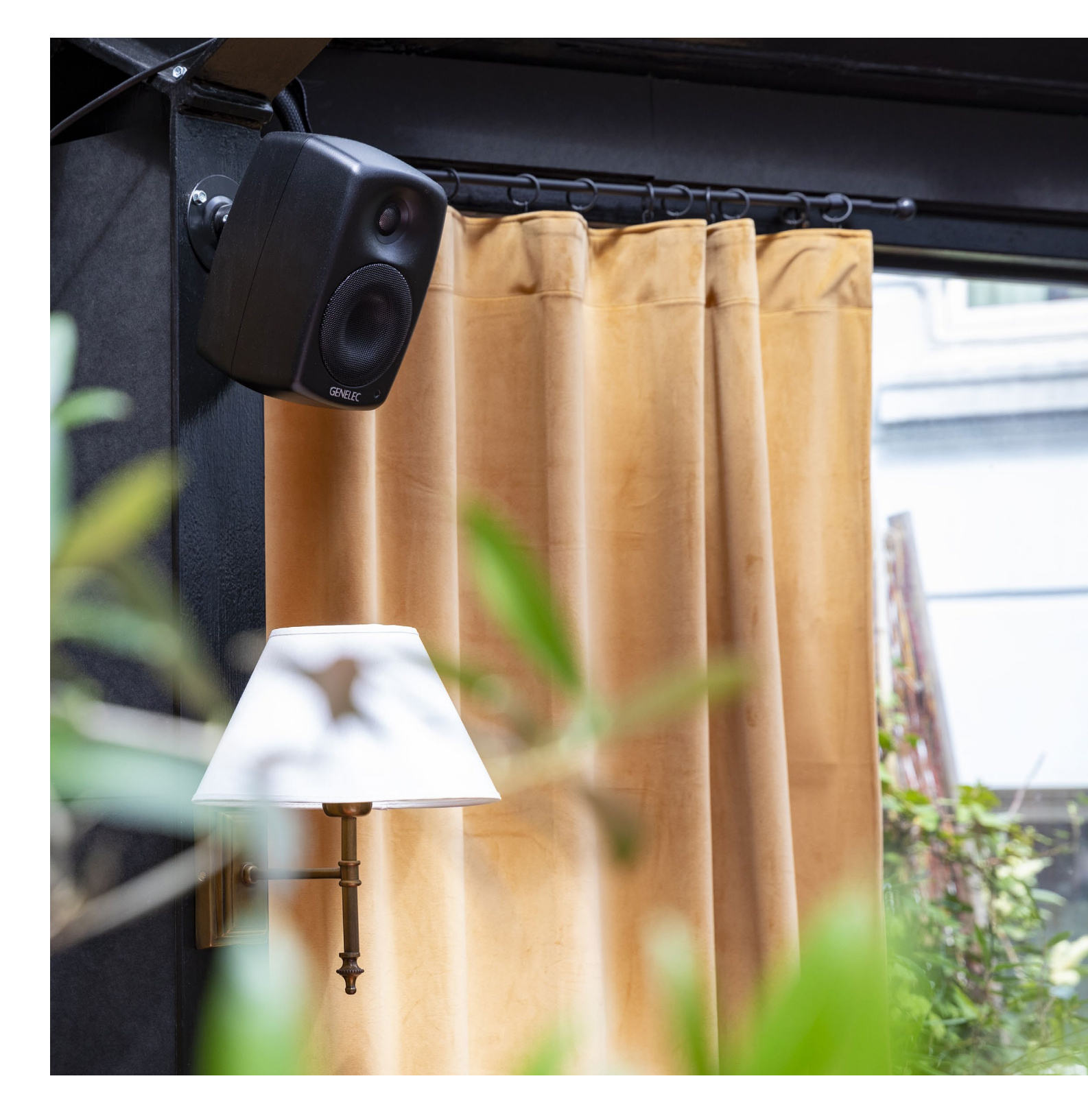
GENELEC'S 4000 SERIES LOUDSPEAKERS ADD ELEGANCE AND AMBIENCE TO TOP-RATED AARHUS RESTAURANT