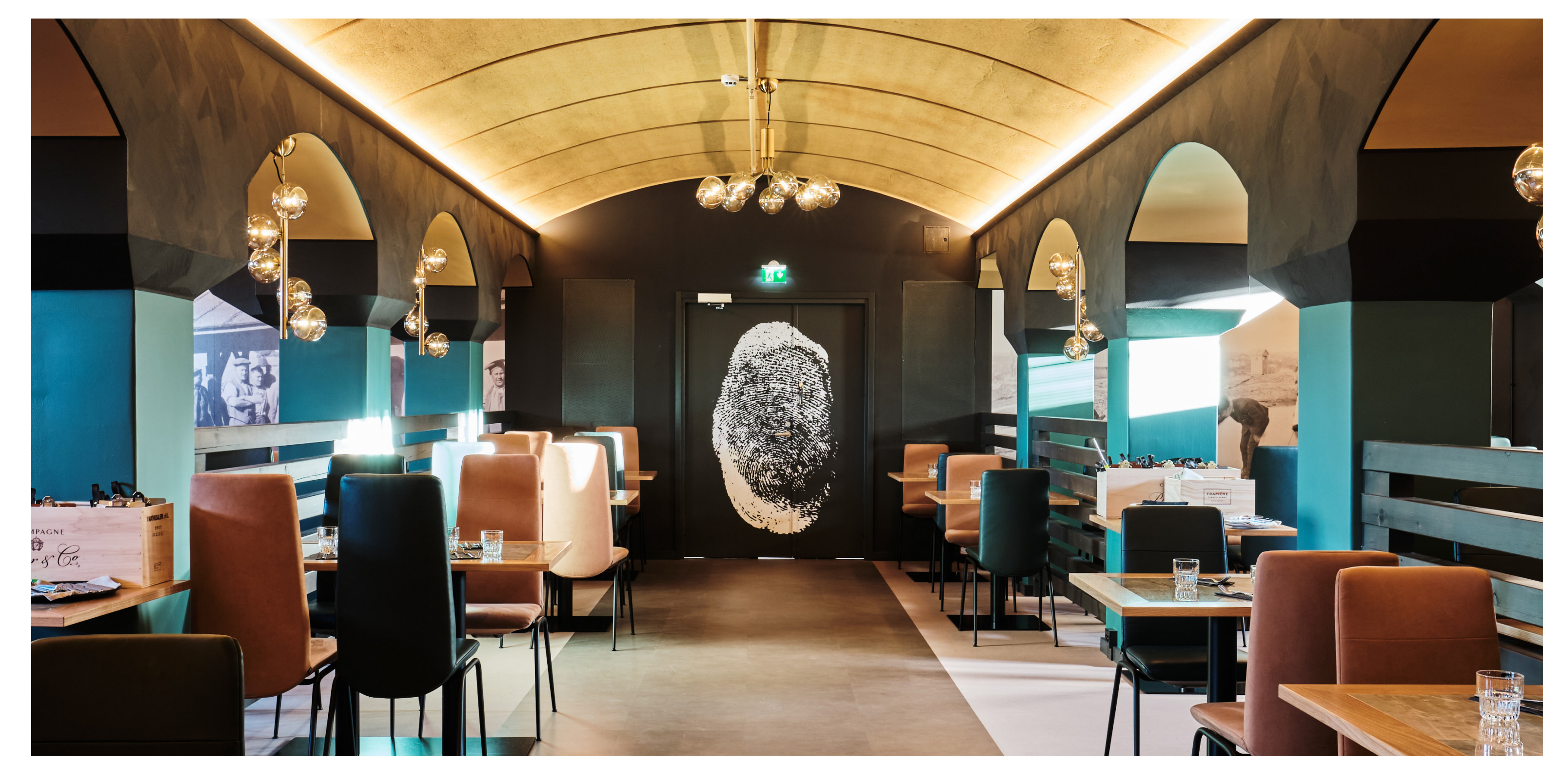
GENELEC DELIVERS A RAW EXPERIENCE BEHIND BARS IN FORMER PRISON-TURNED-HOTEL

f you've ever had a hankering to find yourself behind bars without actually having to commit a crime, then now's your chance: the notorious <u>Kakola</u> prison in the medieval city of Turku on Finland's southwestern coast has been converted into an upmarket boutique hotel complete with sophisticated conference, banqueting and restaurant facilities, and a <u>Genelec</u> sound system. Whilst the food and bedding are