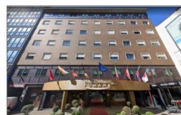
MI – C.so di P.ta Romana, 64 Hotel NRA: 3.500 sqm