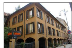
MI – Via San Calimero, 3 Residential/Office NRA: 1.500 sqm

The acquisition was financed by Goldman Sachs Bank Europe SE, with TRIMONT REAL ESTATE ADVISORS as agent bank, and by Natixis S.A., with Société Générale as agent bank.