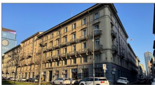
MI – Via Viviani 8/10/12 Office NRA: 13.000 sqm

The strategy envisages a progressive program of redevelopment and enhancement of the neighborhood with a long-term investment perspective.