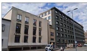
MI – V.le Brenta, 27, 29 Office NRA: 18.100 sqm