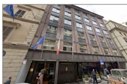
RM – Via Torino, 38 Office NRA: 4.000 sqm