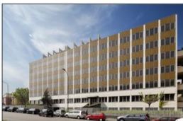
MI – Via Ripamonti, 42 Office NRA 13.500 sqm

A second portion of the portfolio was taken over by another fund managed by COIMA, invested by leading national investors. This acquisition concerns a property located in via Ripamonti, in the area of the Scalo di Porta Romana in Milan, known for having been the headquarters of the Superintendency of Studies, which will be completely renovated to bring it into line with the highest international standards for office buildings.