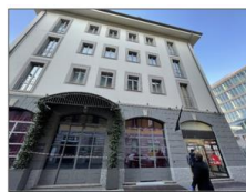
MI – Via Cornalia 7/9 Hotel NRA: 2.700 sqm