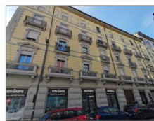
MI – Via Adda 11 Residential NRA: 1.900 sqm