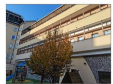
MI – Via Bordononi 2 Office and Kindergarten NRA: 2.500 sqm

The redevelopment project will focus on sustainability issues, both for the rented residence part with energy improvement projects, and for the office part with the following objectives: