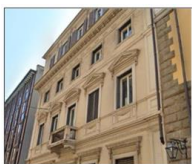
RM – Via Torino, 40 Office NRA: 2.300 sqm

The properties of the fund, covering approximately 36,000 square meters, will be subject to a redevelopment that will lead to a significant energy improvement.