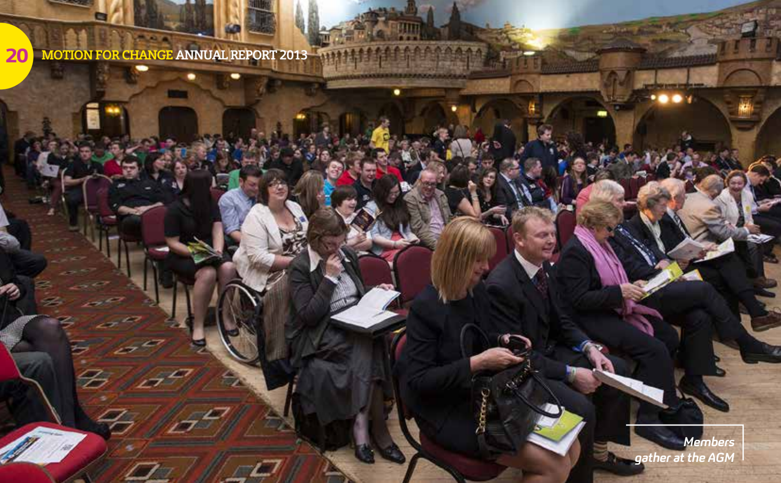
Members gather at the AGM