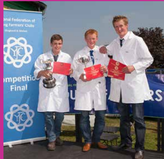
(top) Winners at the dairy stockjudging competition at the Yorkshire Show