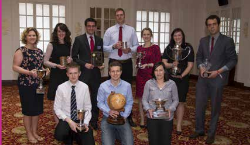
(left) Devon FYFC picked up four awards at the Competitions Weekend (above) the trophy winners announced at AGM