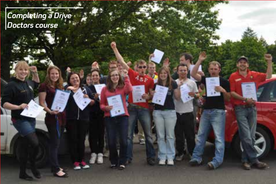
Completing a Drive Doctors course