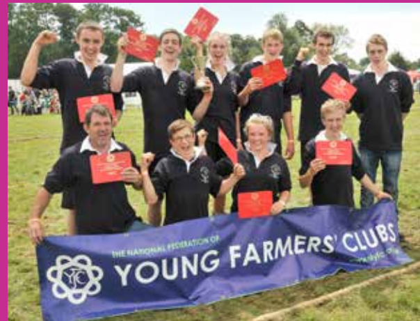
▲ Mixed GENSB Tug of War winners – Lancashire FYFC