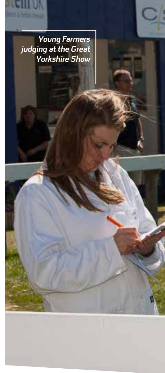
Young Farmers judging at the Great Yorkshire Show

A large part of the Group's focus is on social media activity through Facebook and Twitter. It is an effective way for the Federation to