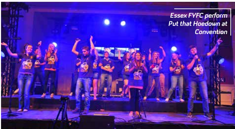
Essex FYFC perform Put that Hoedown at Convention

Competitions remain at the heart of the Federation and are enjoyed by virtually