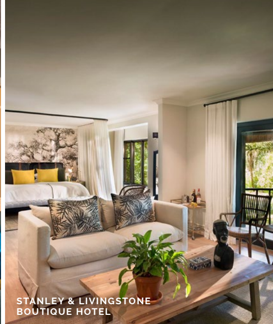
STANLEY & LIVINGSTONE BOUTIQUE HOTEL