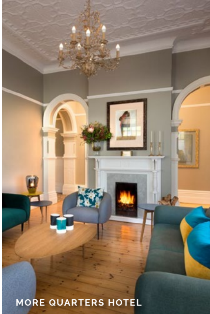
MORE QUARTERS HOTEL