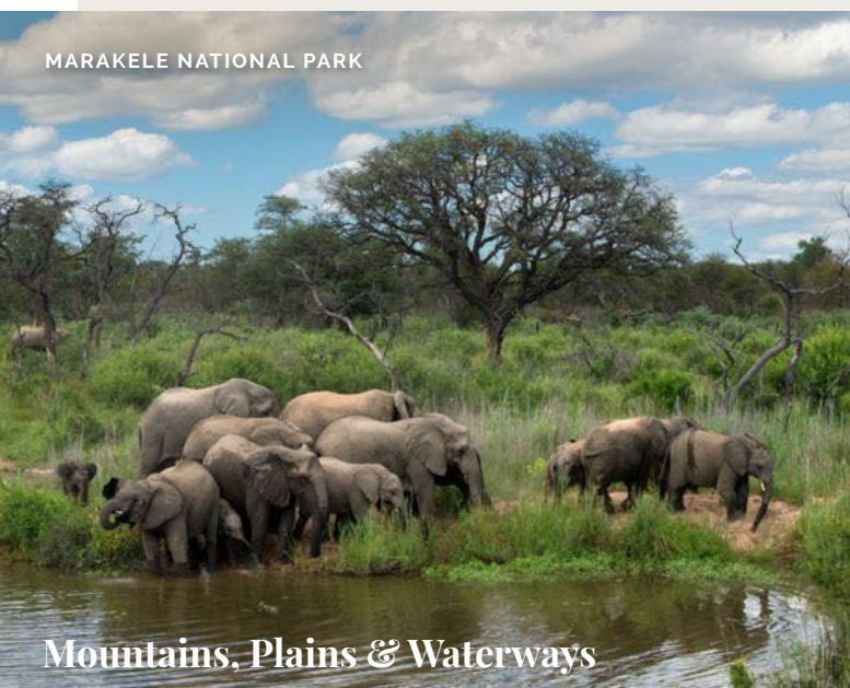
MARAKELE NATIONAL PARK

Including luxury stays all the way, Big Five safaris, Mack & Madi Kids' Adventure Explorers experiences, and a dedicated concierge to ensure your journey is full of fun (and stress-free)