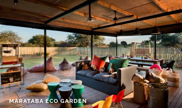
MARATABA ECO GARDEN