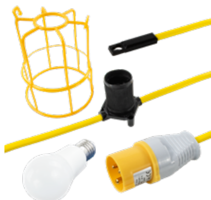
Complete with lamps