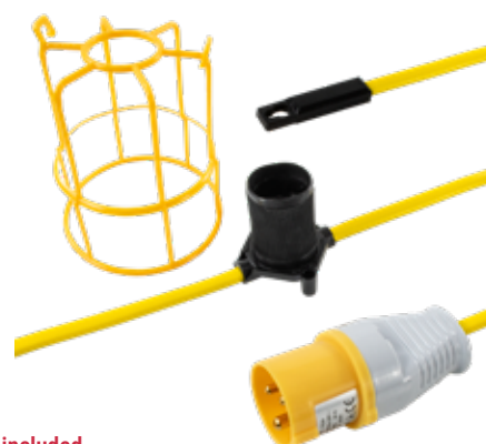
Lamps not included