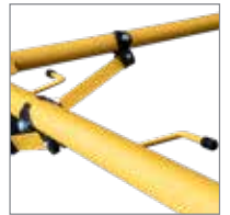
Cable tidy fixture