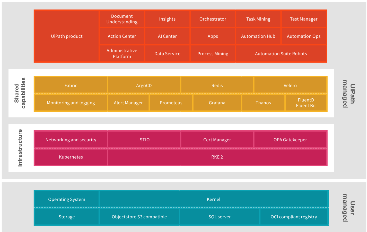
High-level architecture of Automation Suite on Linux