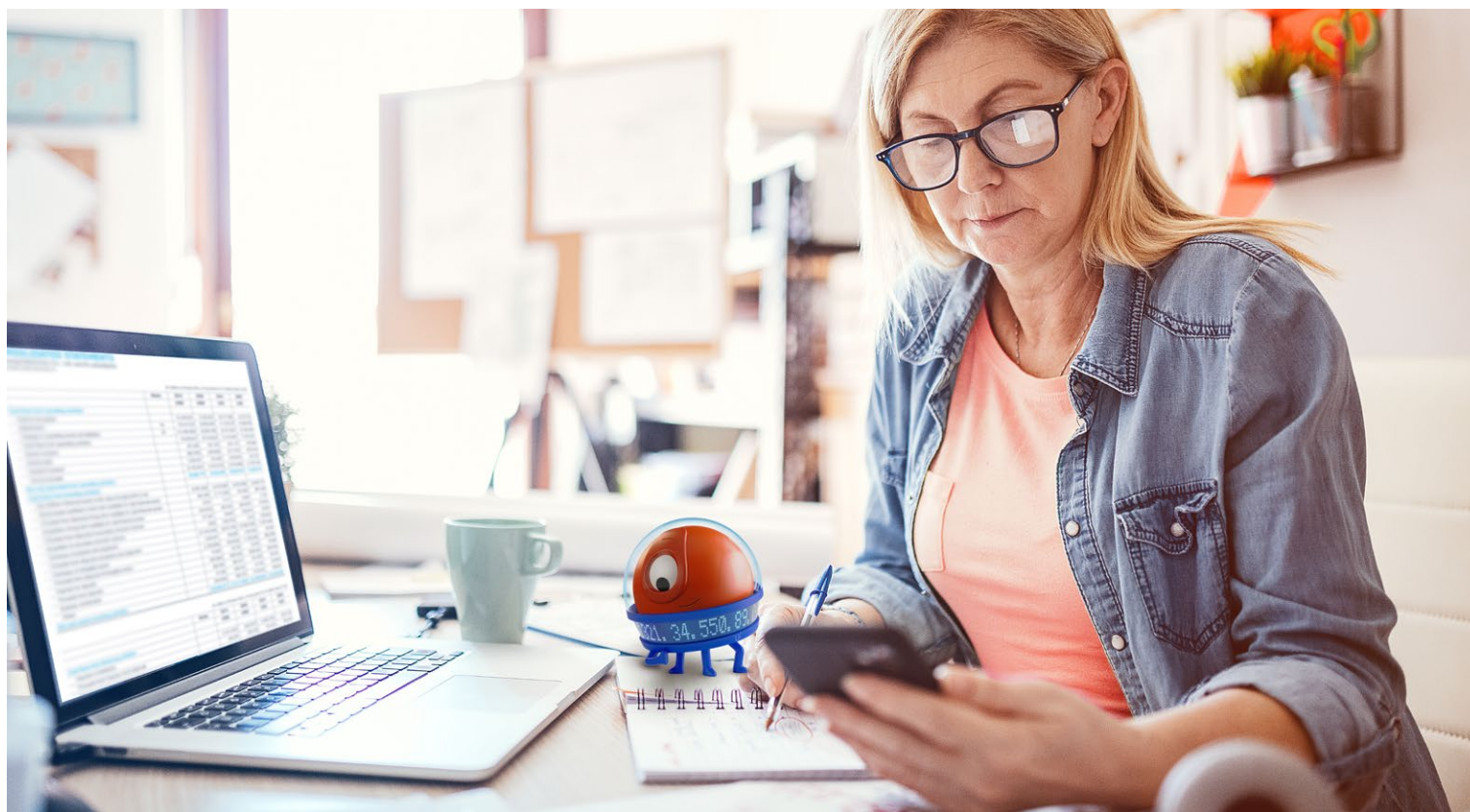
Tableau: The world's leading analytics platform

Tableau has been a leader in the Gartner® Magic Quadrant™ for Analytics and Business Intelligence Platforms for 10 consecutive years—giving you the broadest and deepest end-to-end data and analytics platform.