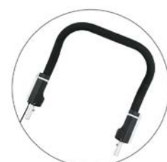
Lighted Handlebar 2016

Yes, all lighted handlebars with the Click & Crooz ® system must be equipped with the additional safety strap.