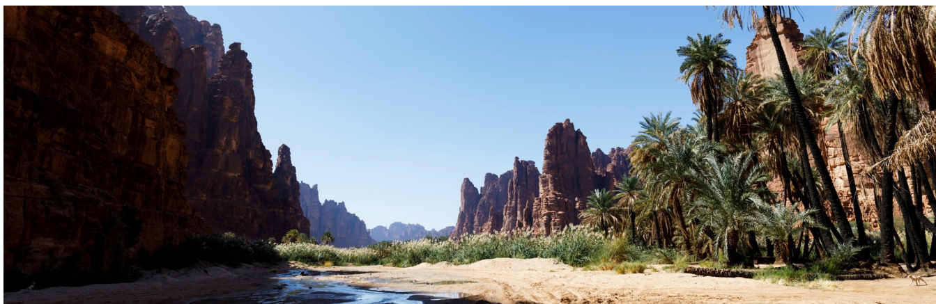
Wadi Disah, Tabuk, Saudi Arabia