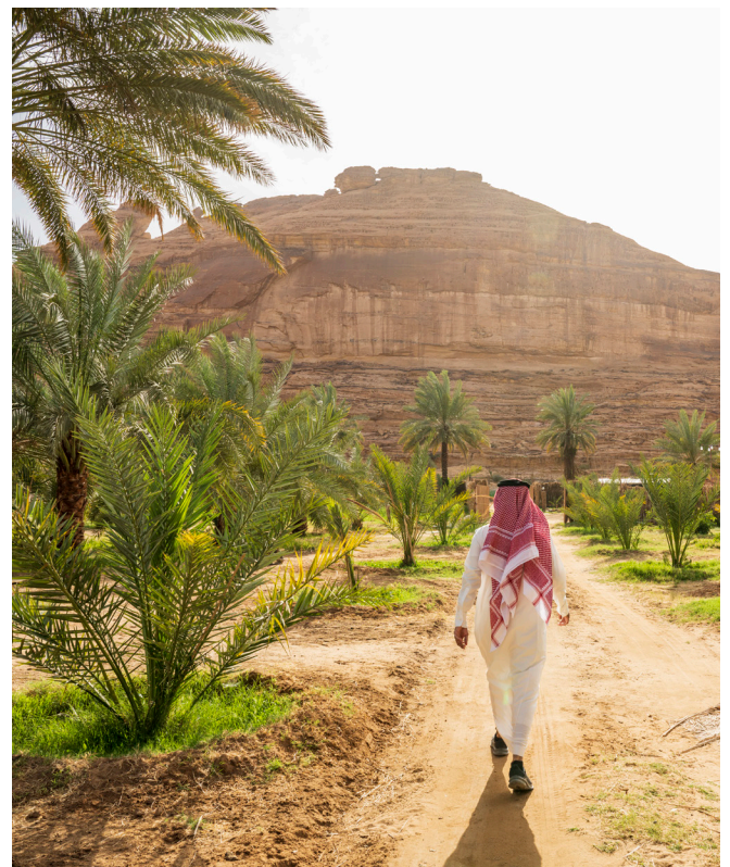
Al-Ula, Saudi Arabia

Exploring five essential pillars of a successful afforestation strategy , how can local entities work in tandem with national leadership to deliver tangible, on-the-ground impact that brings SGI’s vision to life?