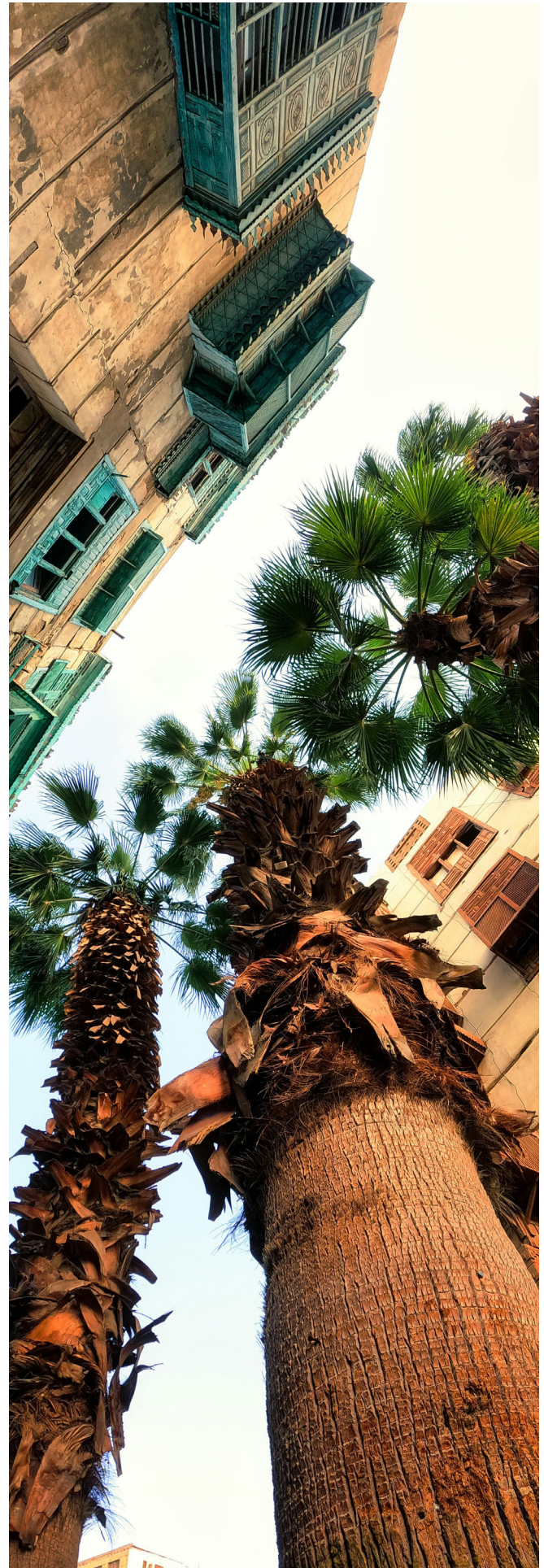
Jeddah, Saudi Arabia

Through these integrated solutions, local entities optimize the use of water and plant resources, enabling sustainable and impactful afforestation outcomes.