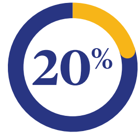
average retail gym membership savings with One Pass Select 3

Half of U.S. consumers report wellness as a top priority in their daily lives. 1 One Pass Select ® is designed to help make it easier for your employees to prioritize their health and wellness through a low-cost, extensive nationwide gym network, digital fitness, grocery delivery service and additional perks. Best of all, your employees have the freedom to choose the option that fits their needs and lifestyle.