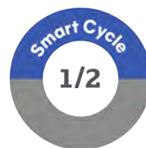
Pre-Transfer Embryology Services