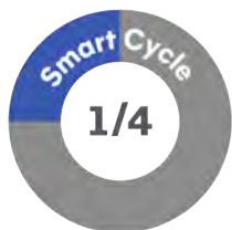
Intrauterine Insemination (IUI)