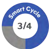
IVF Fresh Cycle

Visit the Explanation of Covered Treatments & Services section of the Member Guide to learn more about what's included in each Smart Cycle and additional covered services. Unless specified, the stated Smart Cycle value for treatment is applied in full, even if you choose to forego any included services. For a full explanation of what's covered under each Smart Cycle, visit the Definitions for Covered Services section.