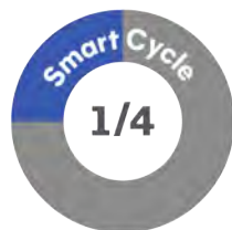
Timed Intercourse (TIC)