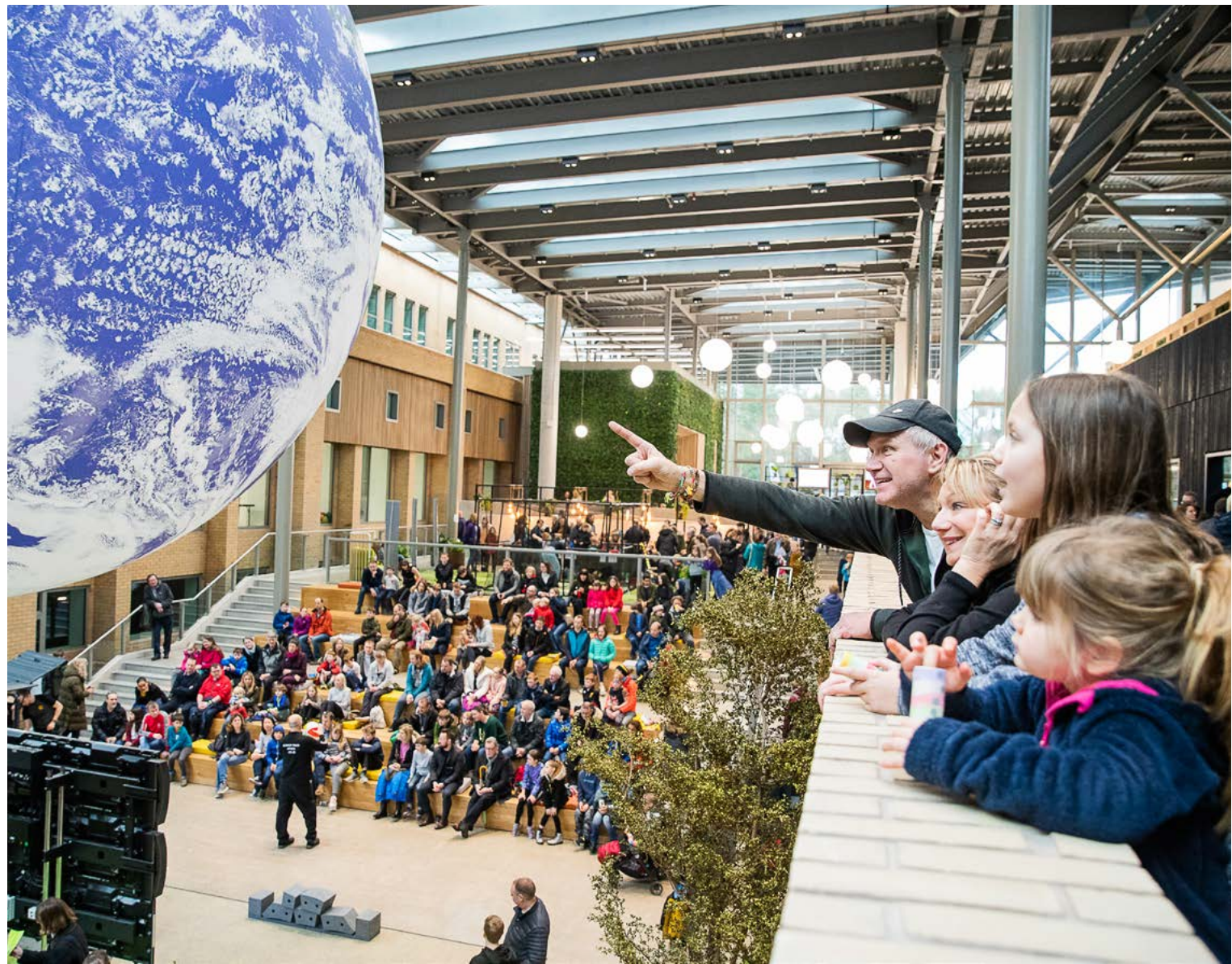
Microdot at Alderley Park

This year over 500 participants took part in the inaugural Run North West trail race, the new gym and sports facilities opened with over 600 members and we held 'Microdot' - a mini-version of the famous 'bluedot' festival which takes place each year at the nearby Jodrell Bank observatory.