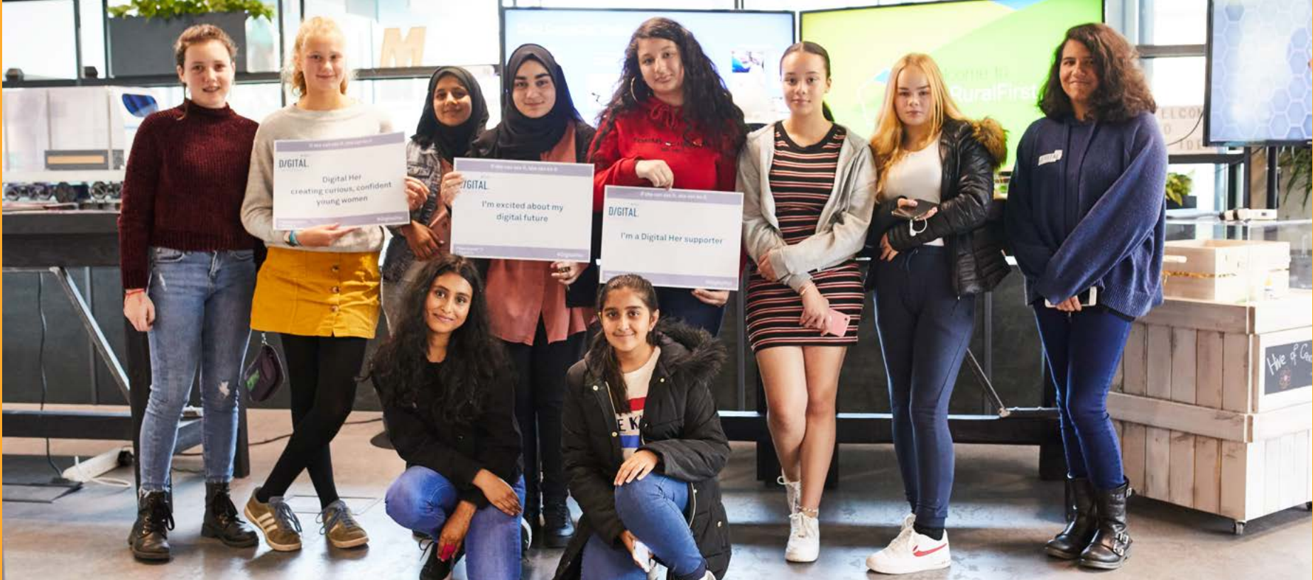
DigitalHer Experience Day at Manchester Science Park