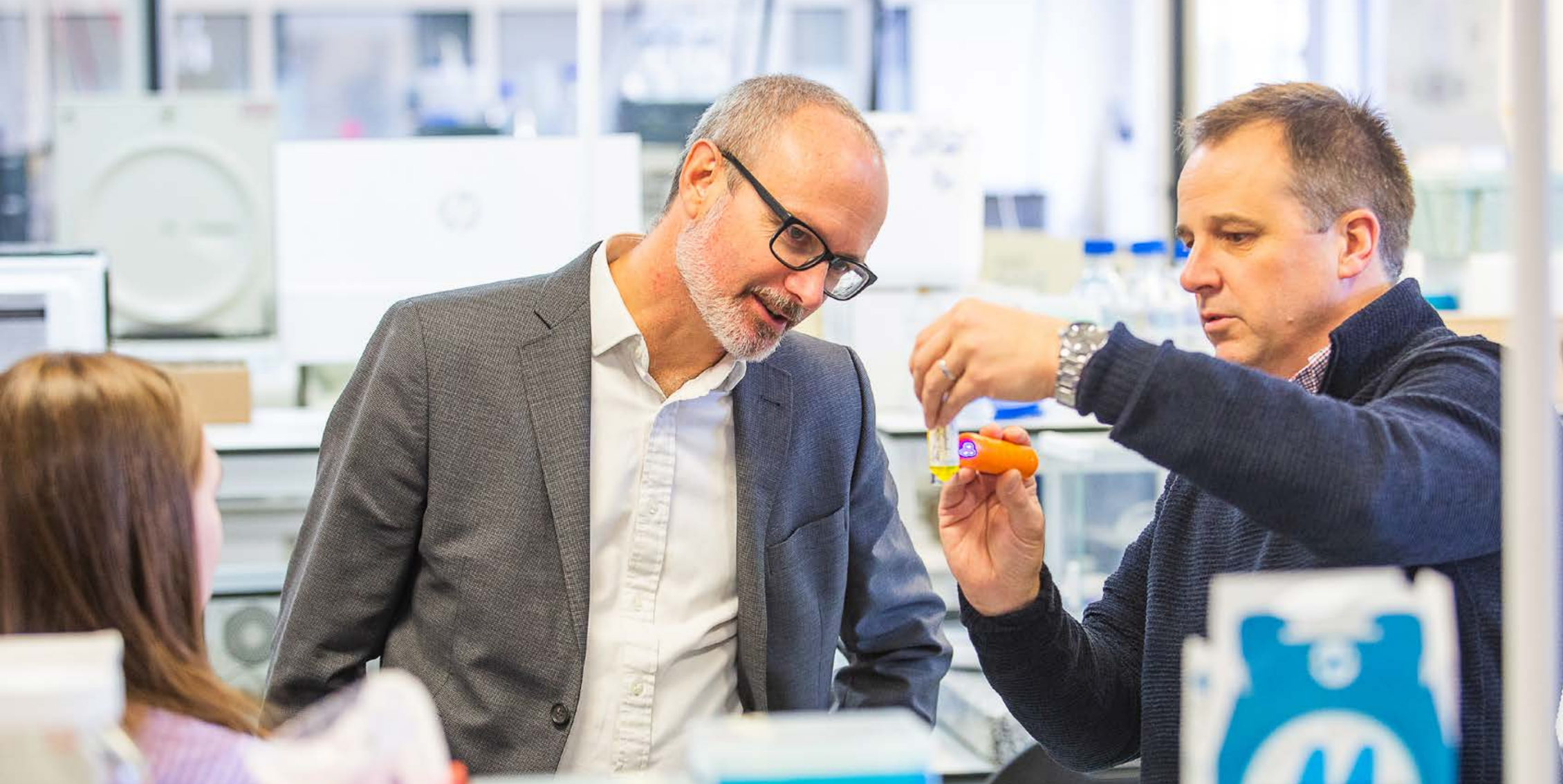
Cytiva Life Sciences Lab launch