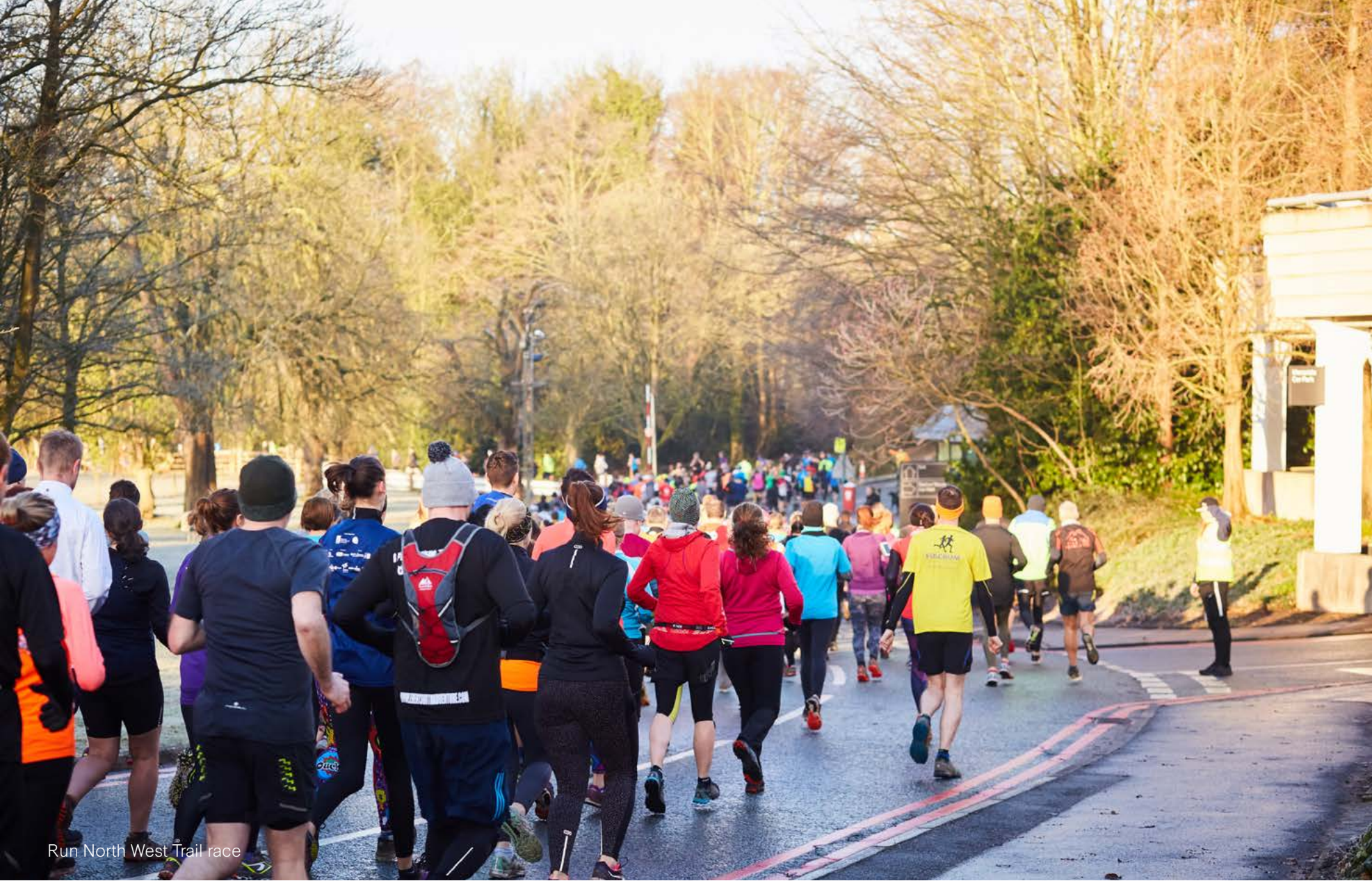
Run North West Trail race

The Churchill Tree, the new village pub and restaurant located in the grade II-listed Tenant's Hall also opened this year. The Churchill Tree was named after the sweet chestnut tree planted by a young Winston Churchill in Alderley Park in the early 20th century.