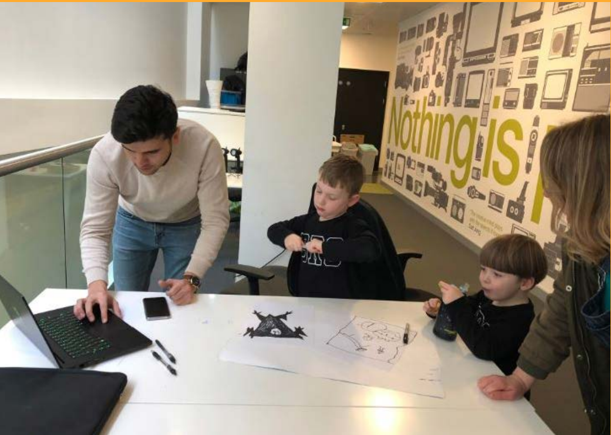
DiceyTech - one of the key businesses involved with STEM Factor created 3D printing projects

During the pandemic, Bruntwood SciTech launched ‘STEM Factor’, a new learning initiative to help educate and inspire children to explore STEM-based challenges and subjects at home. The project set out to help parents and carers supercharge homeschooling lessons with engaging and exciting activities, showcasing the variety and excitement that can be had from STEM activities such as 3D design, hacks, future robots, coding and electronics. The initiative was supported by a number of businesses from across the Bruntwood SciTech network, and was listed by the Science and Industry Museum as one of the UK’s top homeschooling projects.