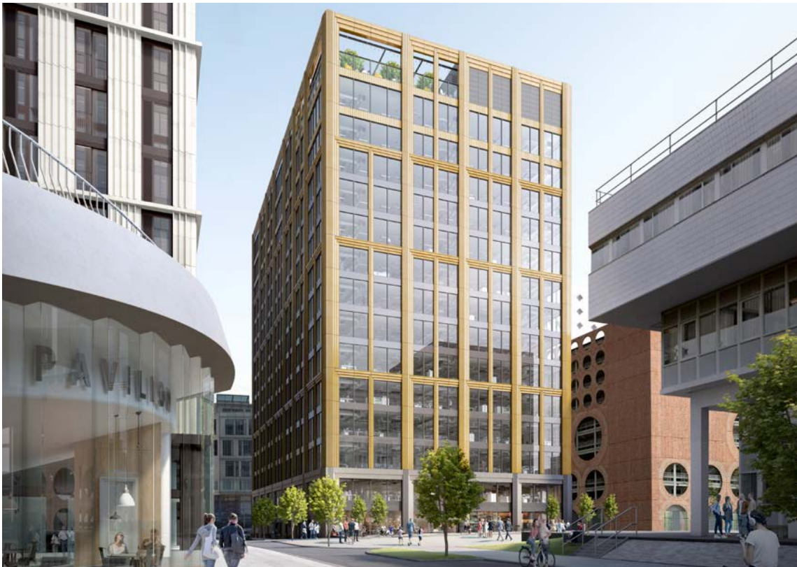
No.3 Circle Square

The next phase of the masterplans for these developments also moved forward with planning permission granted for No.3 Circle Square, the 91,000 sq ft redevelopment of Base at Manchester Science Park, and the £35m development of Citylabs 4.0 - part of the Citylabs genomics, health innovation and precision medicine hub.