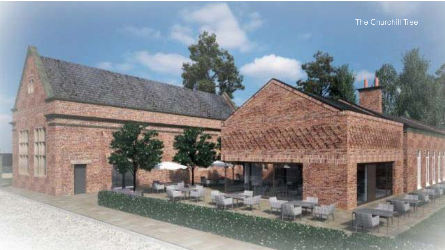
The Churchill Tree

The Churchill Tree, the new village pub and restaurant located in the grade II-listed Tenant's Hall also opened this year. The Churchill Tree was named after the sweet chestnut tree planted by a young Winston Churchill in Alderley Park in the early 20th century.