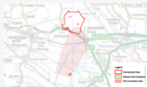
Map indicating outline boundary of site and proposed area for a grid connection to Slicker Fen Substation

Estimated tonnes of CO2 saved (per year) 77,500