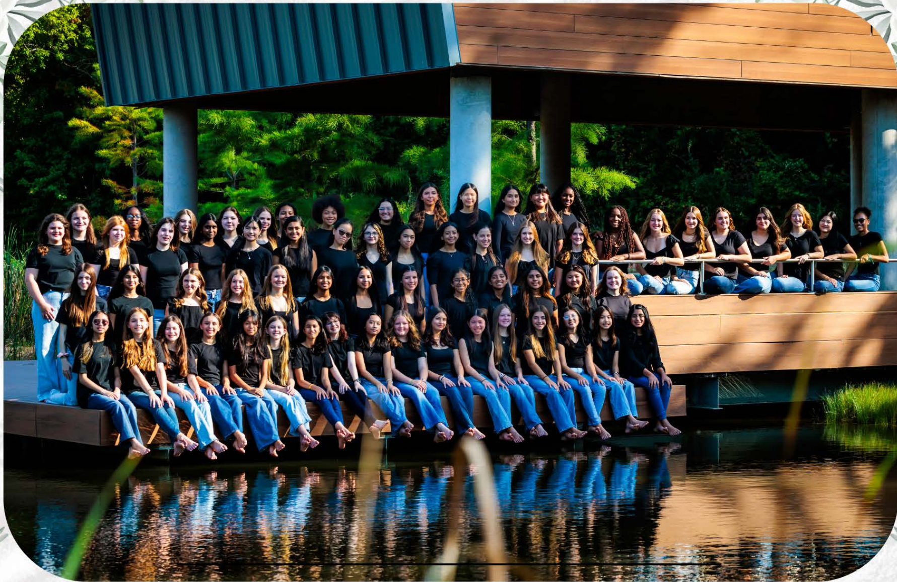
Curtis Middle School Cantare Treble Choir