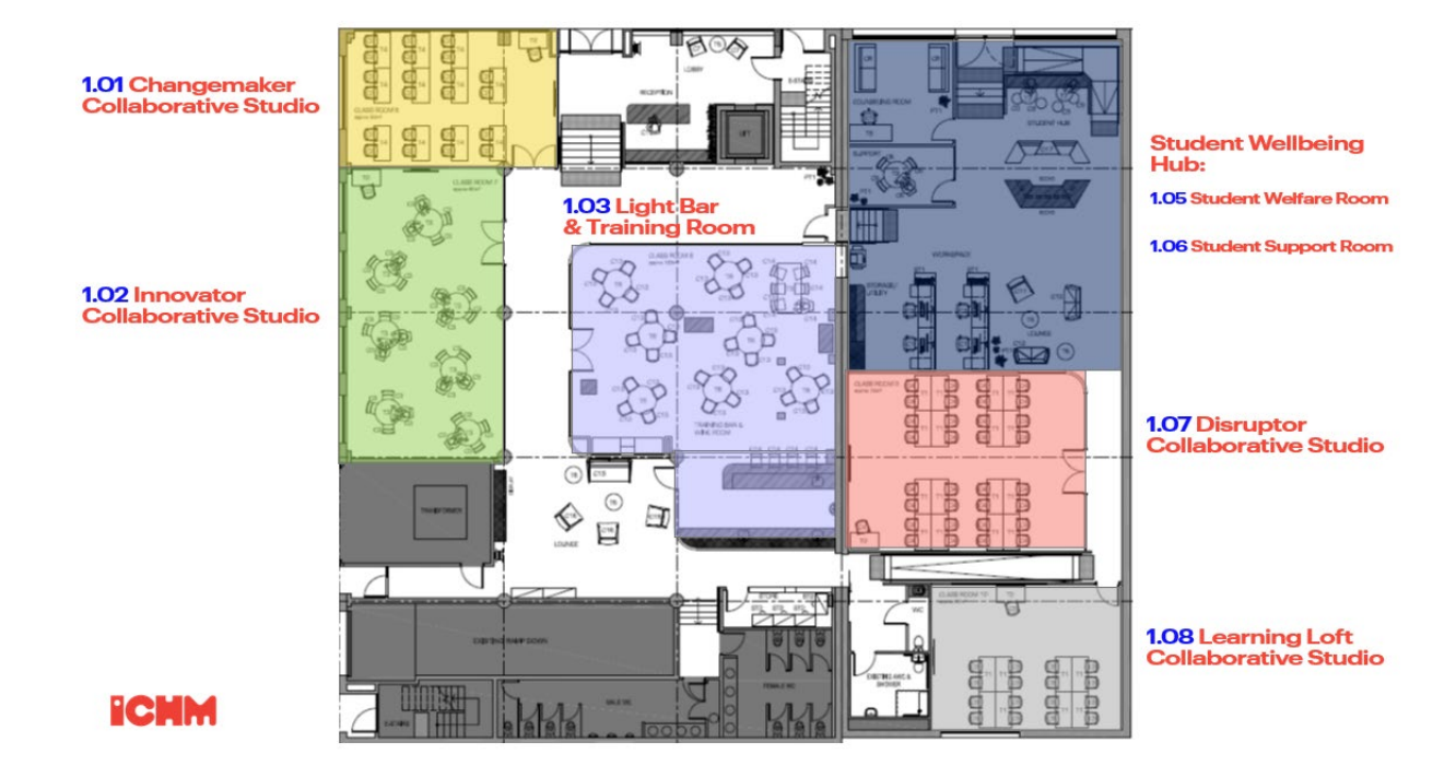
Level 2 - Currie Street Campus