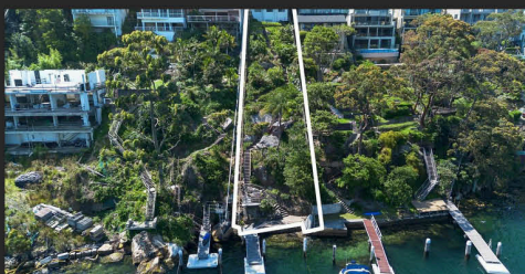
61 Seaforth Crescent Seaforth