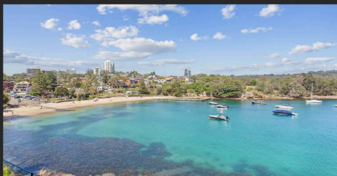
9 Bruce Avenue Manly