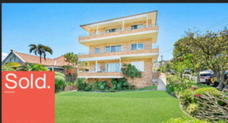
2/75 Stuart Street Manly - $3,250,000