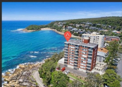
1/132 Bower Street, Manly Coming Soon Contact Agent