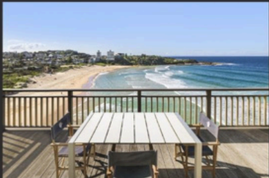
9 Crown Road, Queenscliff Auction 21 st June 10:00am

The Government now has an opportunity to find a solution to permanent ongoing funding for Beachwatch and the opportunity to extend the program further up the harbour to the newly created inner harbour swimming locations.