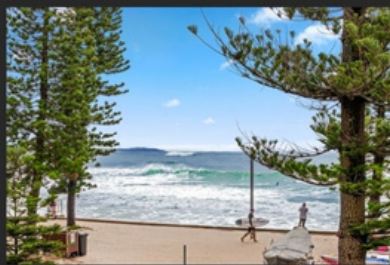
1/49-51 Ashburner Street, Manly