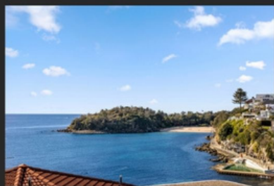
4/104 Bower Street, Manly