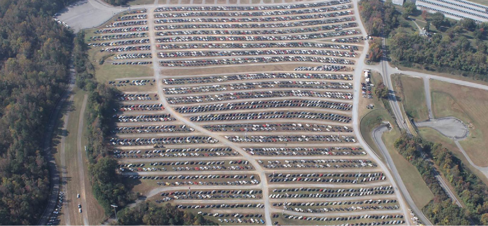
CAT Yard at Richmond International Raceway