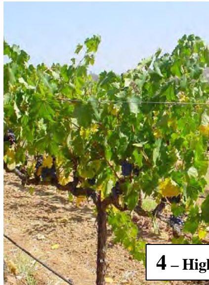
4 - High Stress