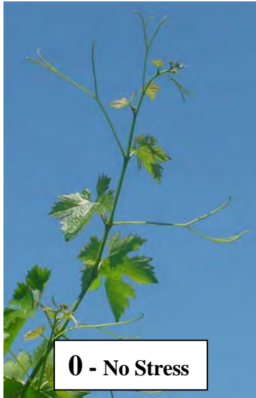
0 - No Stress