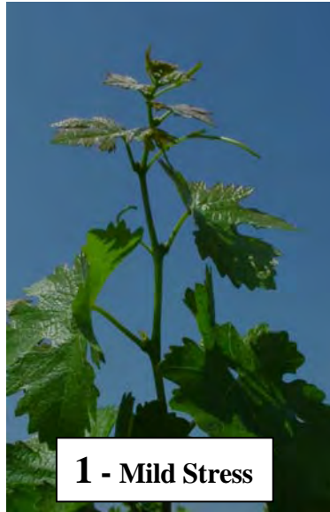
1 - Mild Stress