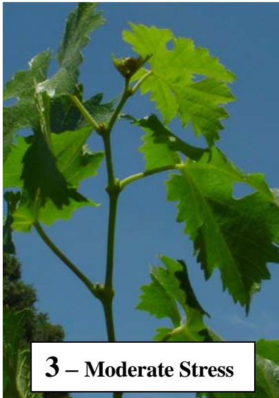
3 - Moderate Stress