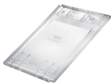
1 Toplight® compliant with main tile