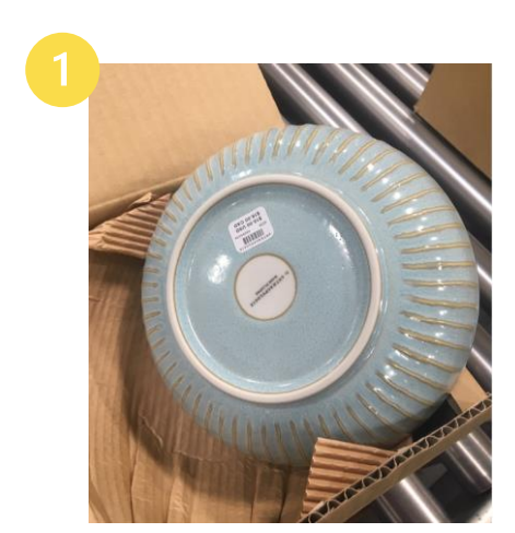
Retail Price Label applied to individual Unit