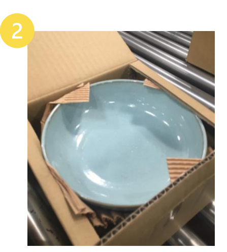
6 Units packed in Inner Carton (Prepack)