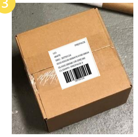
3x3 Prepack Label applied to outside of Inner Carton (Prepack)