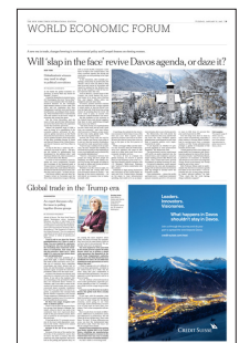
World Economic Forum