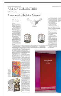
Art of Collecting