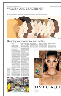
Women and Leadership