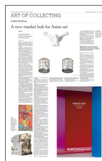
The Art of Collecting