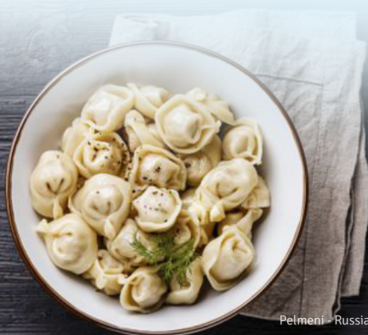
Pelmeni - Russian dumplings

Try also one of our destination specialists' favourite Russian street foods - shashlik - a meat skewer.