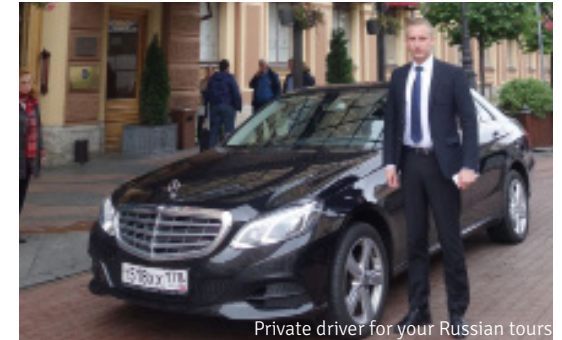
Private driver for your Russian tours