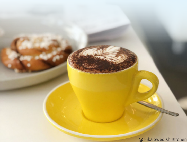
@ Fika Swedish Kitchen

In cafes, you’ll find mostly muesli and yoghurt or bread rolls with ham and cheese served in the morning hours. On weekends, however, it’s a whole different story. Popular brunch spots fill up quickly, so be sure to book ahead!