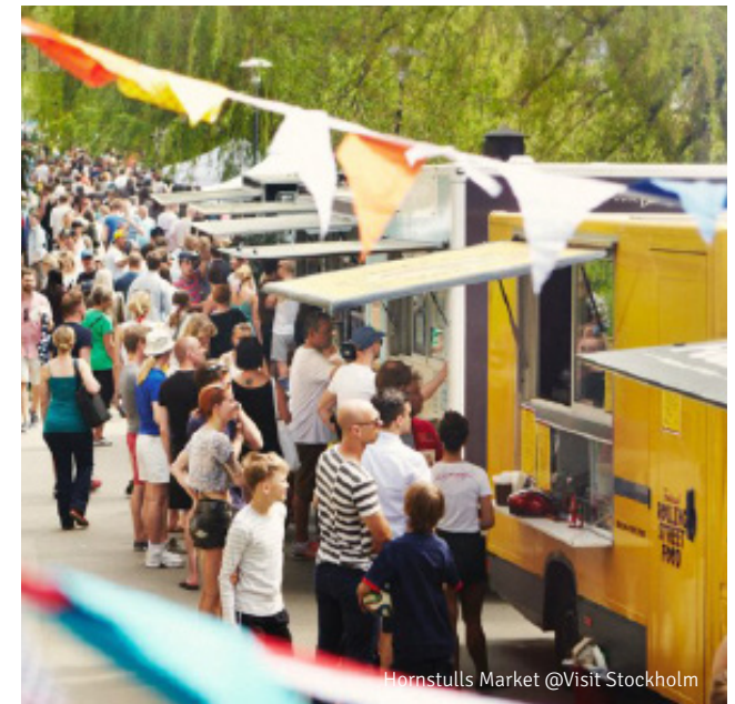
Hornstulls Market @Visit Stockholm

Hornstulls marknad is an outdoor street market situated in the western part of Södermalm. The market stretches along the waterfront and has become one of Stockholm's favorite Sunday activities. Expect to find a variety of vintage, second-hand, art, food trucks and everything else that comes with a proper street market. Open every Saturday and Sunday 11:00-17:00, April through to October.