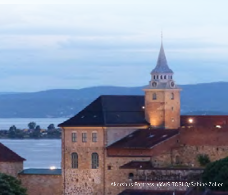
Akershus Fortress

Oslo has everything you would expect from a capital. The city offers an abundance of attractions, shopping possibilities and a flourishing cultural life, and a choice of restaurants which is almost unparalleled in Scandinavia.