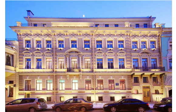
Domina Prestige Hotel