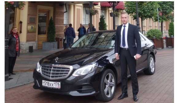
Private driver for your Russian tours