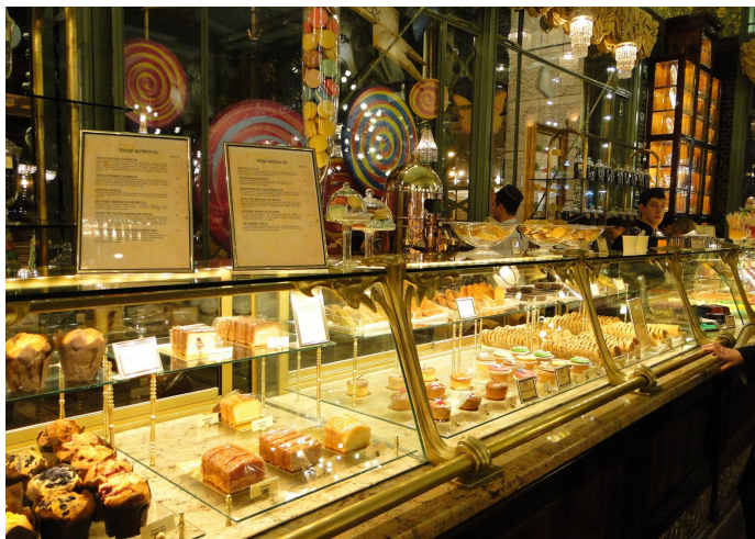
Food Hall Kupetz Eliseevs

Address: Nevsky pr 56. Web: kupetzeliseevs.ru