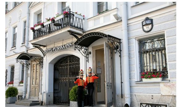
Pushka Inn Hotel