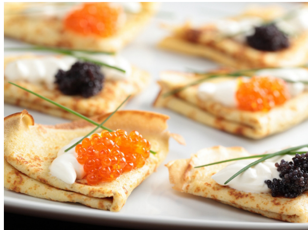
Russian blinis with caviar

Address: Moyka River Embankment 16 Web: http://eatinyat.com/home-english.html