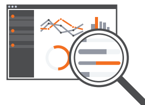
Big Data Analytics