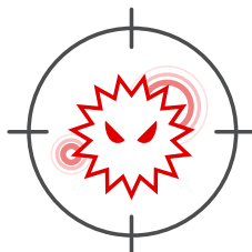
Automated DDoS Mitigation