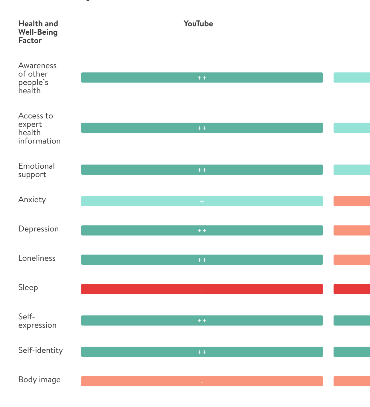
Table 5: Effects of Popular Social-Media Apps on Young People's Health and Well-Being

mental health and well-being, and found both positive and negative effects for all of the big apps (see table 5). ^{34}