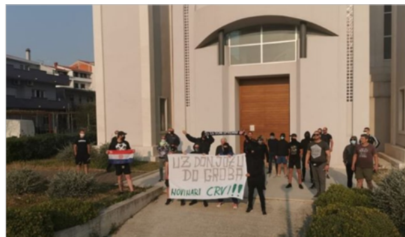
Figure 9 – Far-right activists gather in front of church in Split, Croatia

majority of whom are Muslim) attempting to cross the border from Bosnia with the purpose of identifying them. 83