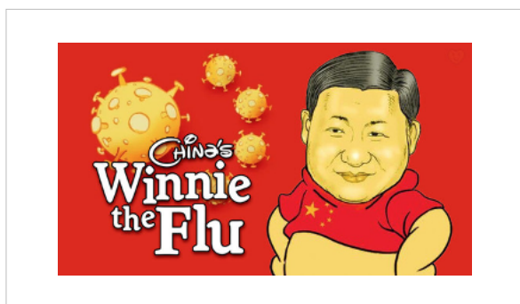
Figure 3 – Image shared on far-right social media platform GAB, mocking China’s president Xi Jinping 13

China has been one of the key targets of Covid-19-related conspiracies, with theories even claiming China is blackmailing countries to accept Chinese 5G infrastructure in exchange for vital medical supplies. 11 Conspiracy theories about China have entered the mainstream, although not all of them have originated in far-right circles, as more mainstream conservatives who are politically opposed to China have been quick to assign blame.