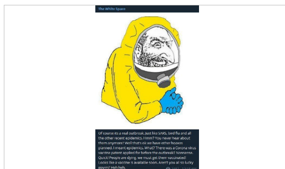
Figure 4 – Meme of the “happy merchant” (anti-Semitic drawing depicting a Jewish person rubbing his hands with greed) in the context of coronavirus that was widely shared on encrypted messaging app Telegram and discussion forum 4chan from January to March 22

this theory. 21 This theory is generally espoused by core neo-Nazi groups and has not entered the mainstream, although it has been embraced in Islamist circles too.