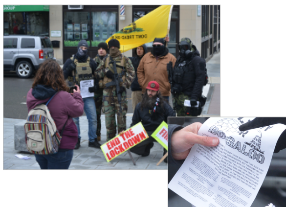
Figure 5 – Far-right protestors dressed in armour and holding a sign calling for "boogaloo" (term referring to an impending civil war) during an anti-lockdown protest in New Hampshire 35