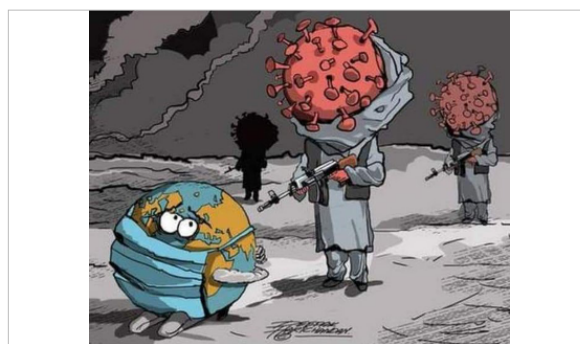
Figure 11 – Cartoon published by newspaper The Hindu depicting coronavirus as a Muslim dressed in a Pathani suit (common Muslim dressing in India) with an assault rifle pointed at the Earth 94

This has similarities with how far-right actors in the UK have portrayed Muslims as deliberately spreading the disease. In the UK, Tommy Robinson has also resorted to the use of hashtags #CoronaCriminals and #GermJihad in the context of claiming that a man who had reportedly attacked elderly people on the street was a Muslim immigrant who should be deported.