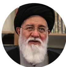
Ayatollah Ahmad Alamolhoda

Supreme leader’s representative to Khorasan Razavi and member of ISU’s board of trustees