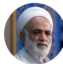
Hojatoleslam Mohsen Gharati

Senior member of the Office of the Supreme Leader