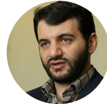
Hojatollah Abdolmaleki Minister of cooperatives, labour and social welfare