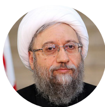
Ayatollah Sadegh Larijani

Supreme leader’s representative to Khorasan Razavi and member of ISU’s board of trustees