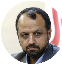
Ehsan Khandoozi Economics minister