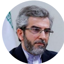
Ali Bagheri Kani Deputy foreign minister and lead nuclear negotiator