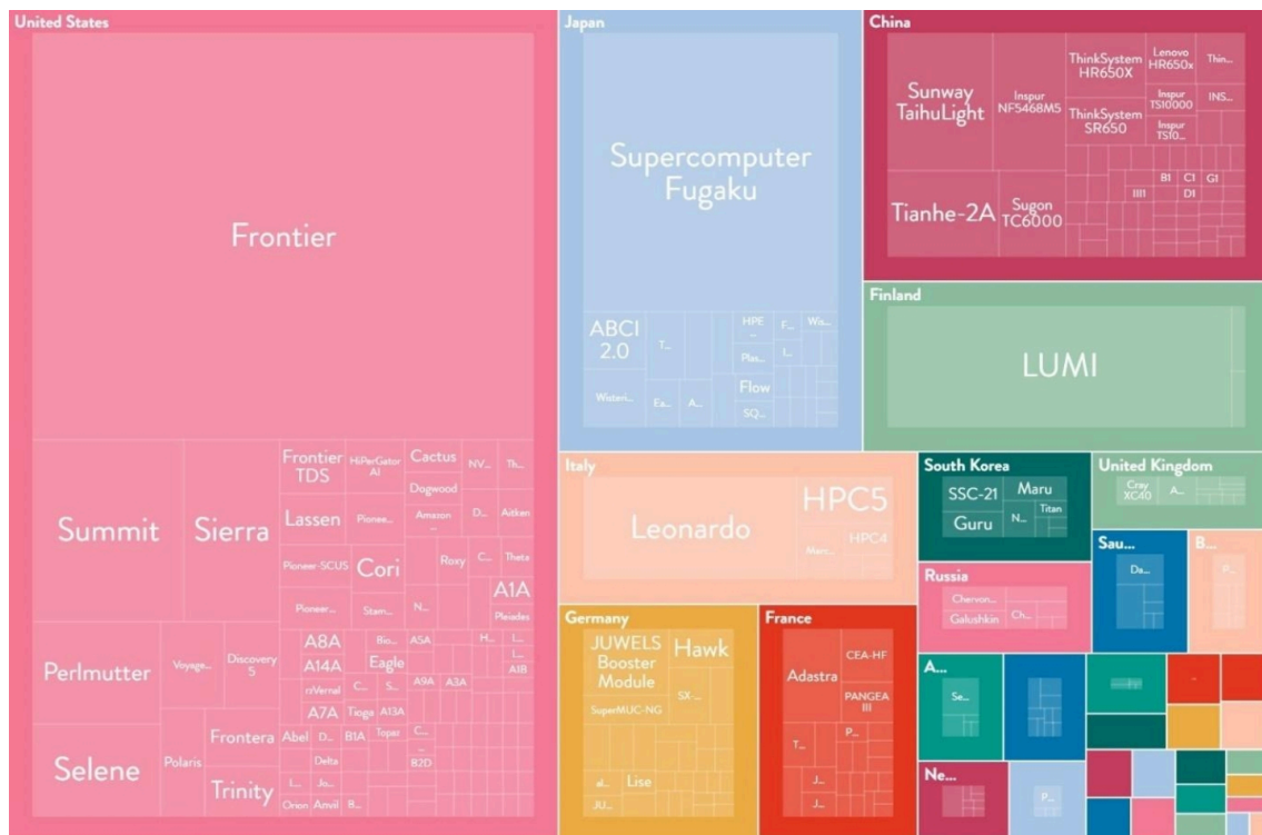
Figure 1 – The aggregate computing power of the TOP500 supercomputers in the world, grouped by country