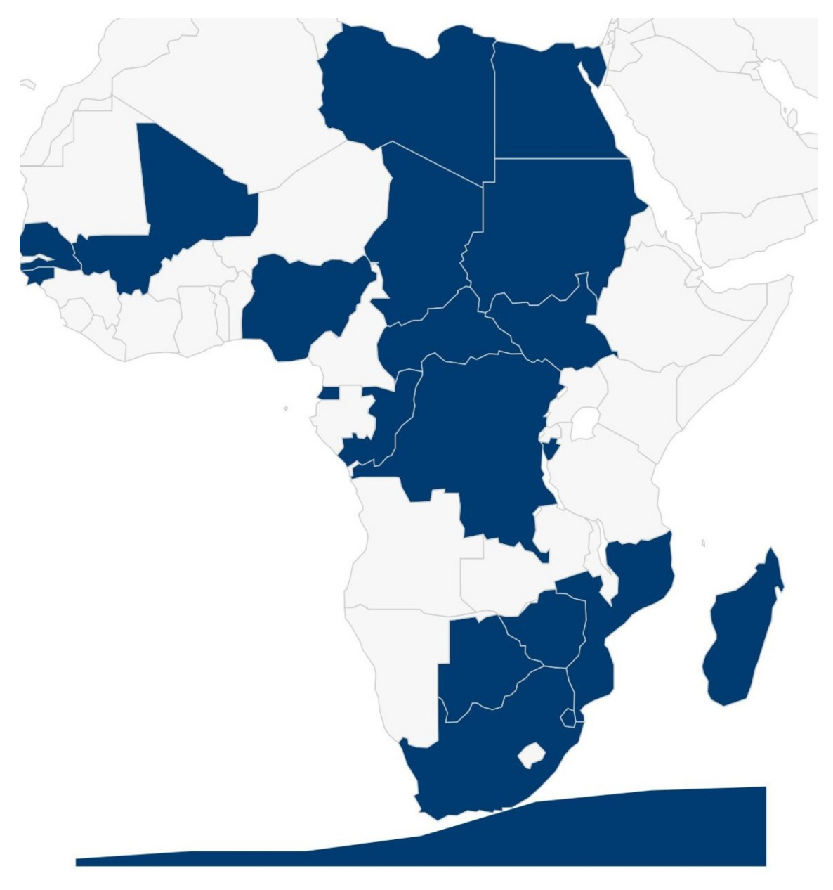
Figure 1 – How the activity of Russian private military contractors is proliferating across Africa