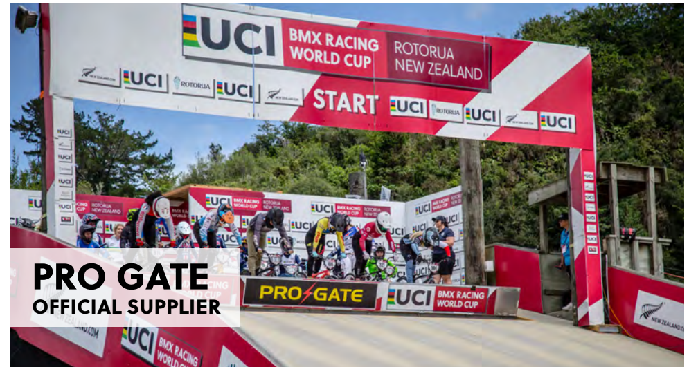
PRO GATE OFFICIAL SUPPLIER

Pro Gate is an Illinois-based American company specialising in the manufacture of start gates for BMX Racing. It has been the Official Gate Supplier for all UCI BMX Racing events since 2004 as well as sole supplier of the Olympic Games since the discipline joined the Olympic programme in Beijing (China) in 2008. Pro Gate plays an important role in developing the discipline of BMX Racing, notably through its contribution to the UCI World Cycling Centre.