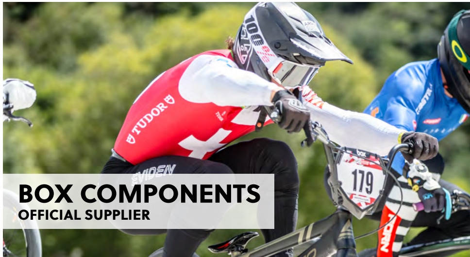
BOX COMPONENTS OFFICIAL SUPPLIER