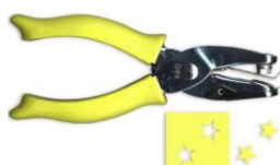
*Example of scorecard marker: FISKARS decorative punch